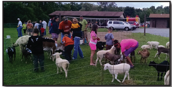
The petting zoo was a big family hit!

Did you know that the storm water drains and inlets within your neighborhood have an important impact on the water quality of our streams? Why? Because storm drains flow directly to nearby rivers and streams, not to wastewater treatment plants. Everything that rain washes off of your roof, yard, and driveway goes to the nearby water used for swimming, boating, and maybe even drinking. In addition, anything that is dumped into these drains, such as used motor oil, paint, or excess pesticides, goes directly into a local stream. We'd like to remind everyone - homeowners, business owners, developers, and other citizens - not to dump anything into storm drains so we can protect our water from storm water pollution. Thank you for your help in keeping our streams clean!