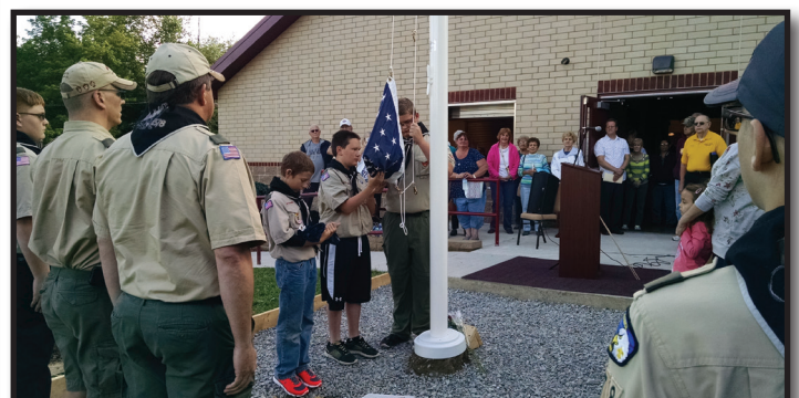
Boy Scout Troop 1378 prepare to raise the American and Commonwealth of Pennsylvania Flags as part of flagpole dedication ceremony